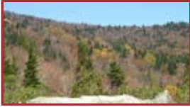
Trees in habitat on Grandfather Mountain, North Carolina.