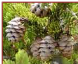
Previous year cones on the above tree.