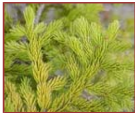
Foliage on the above tree. The "tufted" appearance distinguishes this species from Picea glauca or P. mariana.