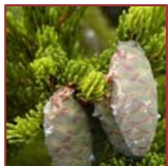
Current year cones on the above tree. Cone size is intermediate between Picea glauca and P. mariana.