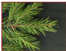
Detail of twigs and foliage from a tree on Mt. Mitchell, North Carolina.